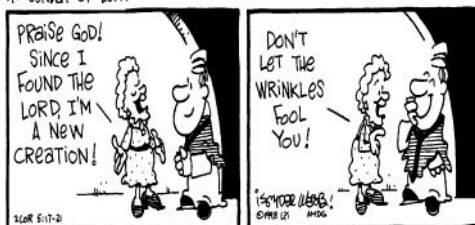
4 th SUNDAY OF LENT

Trivia Answer from page 5: Recessional hymn.