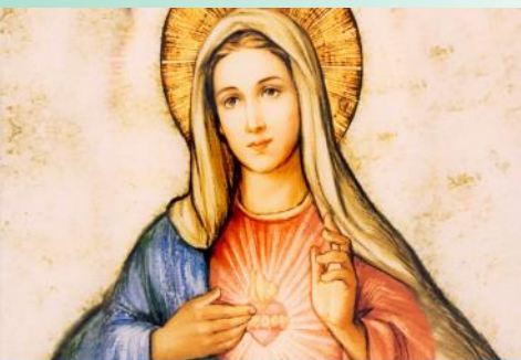
AUGUST Month of the Immaculate Heart