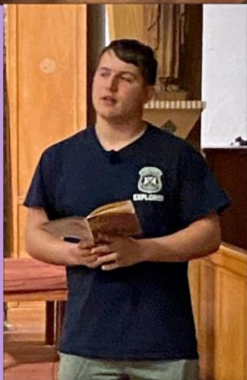
At our Faith Formation on March 4 the 7th/8th grade students led the Stations of the Cross for the students and their families.