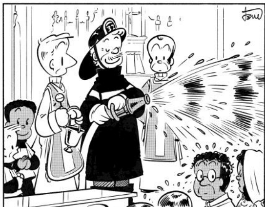
"The Sprinkling Rite."