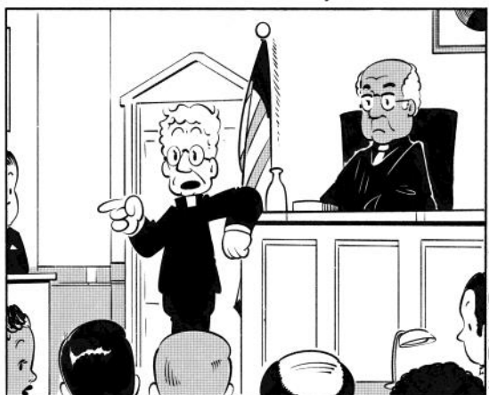
the FAITHFUL FUNNIES

"What do you call a Catholic priest who became a lawyer?"