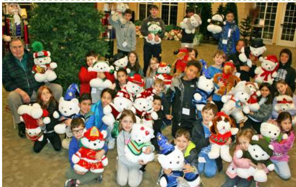
2023 Faith Formation and Santa Bears