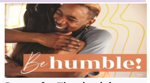
Prayer for Thanksgiving

Jesus teaches about the importance of using our God-given gifts faithfully and prudently in the parable of the talents. What gifts have you used well in your life?