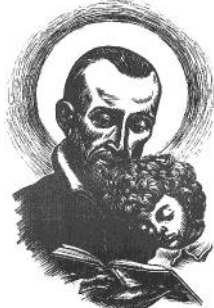
St. Joseph Calasanz Patron of All Christian Schools "YOUTH is the future of any country and the hope for necessary changes."

Today, The Piarist School continues to grow, increasing its enrollment every year. The school IS accredited by the state & is a member of the Kentucky High School Athletic Association, fielding teams in basketball & cross country.