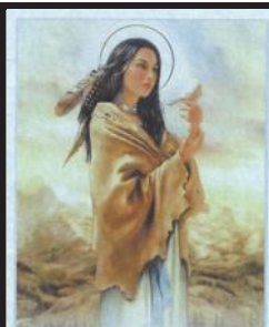
St. Kateri Tekakwitha Church 2022 Guide Book & Directory

In the parable of the Pharisee and tax collector, Jesus teaches crowds the proper approach to prayer: “O God, be merciful to me a sinner.” What do you think God says in response?