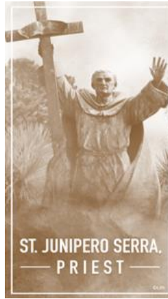
ST. JUNIPERO SERRA, PRIEST