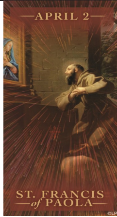
ST. FRANCIS of PAOLA

Next Sunday: Is 43:16-21/Ps 126:1-2, 2-3, 4-5, 6 [3]/Phil 3:8-14/Jn 8:1-11