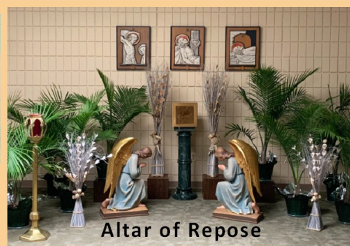
Altar of Repose