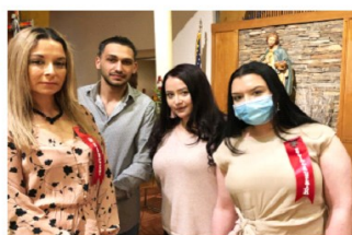
Confirmandi with their sponsors